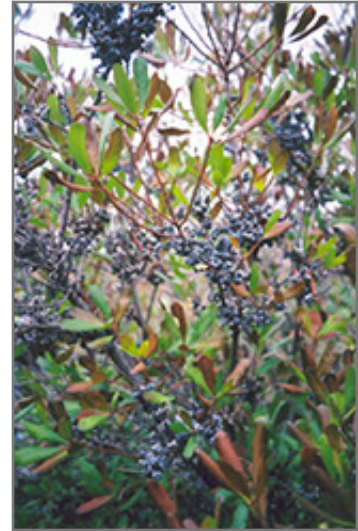
Northern Bayberry fruit

This shrub does best in full sun to partial shade. It does best in average to evenly moist conditions, but will not tolerate standing water. It is very fussy about its soil conditions and must have sandy, acidic soils to ensure success, and is subject to chlorosis (yellowing) of the foliage in alkaline soils, and is able to handle environmental salt. It is highly tolerant of urban pollution and will even thrive in inner city environments. This species is native to parts of North America.