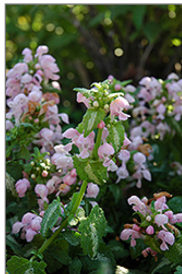
Shell Pink Spotted Dead Nettle flowers