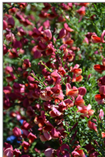
Sister Rosie Scotch Broom flowers