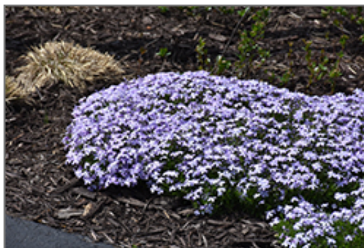
Spring Blue Moss Phlox in bloom