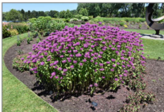
It's Magic Beebalm in bloom