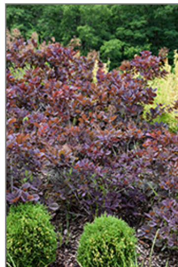
Velveteeny Purple Smokebush