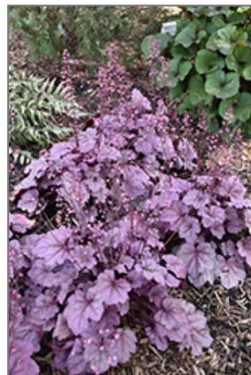
Pink Panther Coral Bells in bloom

Pink Panther Coral Bells is recommended for the following landscape applications;