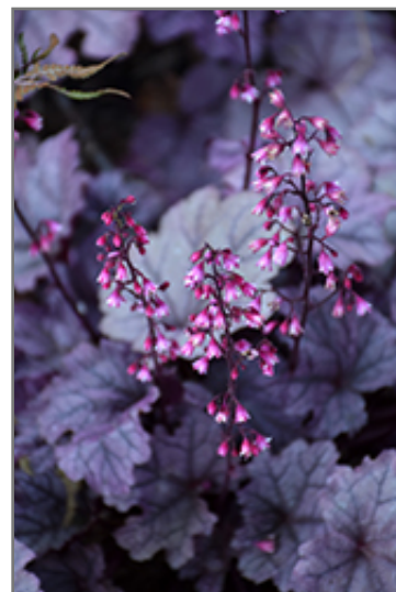
Pink Panther Coral Bells flowers

Pink Panther Coral Bells is a fine choice for the garden, but it is also a good selection for planting in outdoor pots and containers. With its upright habit of growth, it is best suited for use as a 'thriller' in the 'spiller-thriller-filler' container combination; plant it near the center of the pot, surrounded by smaller plants and those that spill over the edges. Note that when growing plants in outdoor containers and baskets, they may require more frequent waterings than they would in the yard or garden.