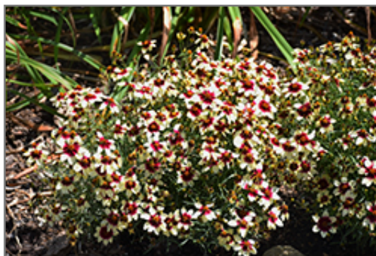
Sizzle And Spice Red Hot Vanilla Tickseed in bloom