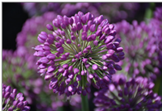
Lavender Bubbles Ornamental Onion flowers