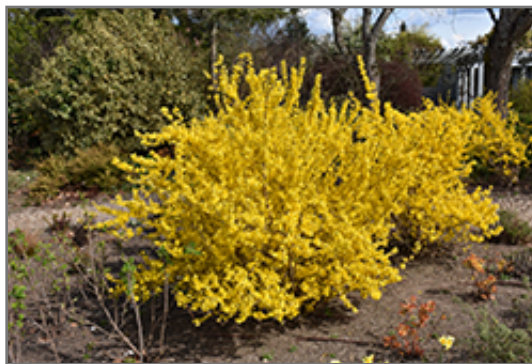
Magical Gold Forsythia in bloom