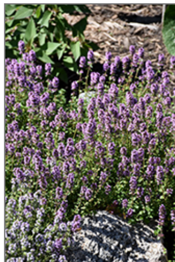
Oregano Thyme in bloom