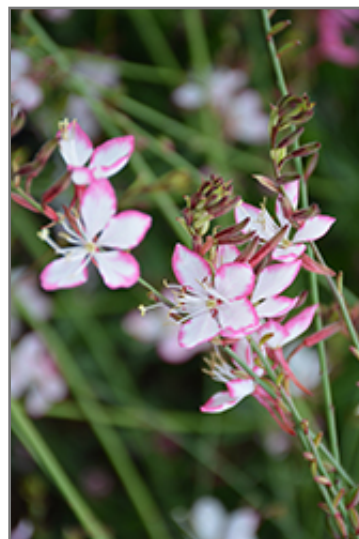
Rosy Jane Gaura flowers

Rosy Jane Gaura is recommended for the following landscape applications;