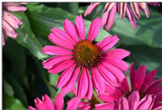
Kismet Raspberry Coneflower flowers