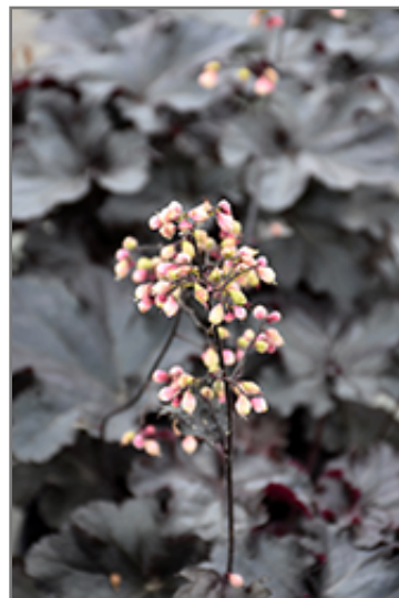
Black Pearl Coral Bells flowers