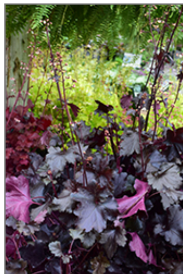
Black Pearl Coral Bells in bloom

Black Pearl Coral Bells is recommended for the following landscape applications;