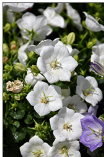
Rapido White Bellflower flowers