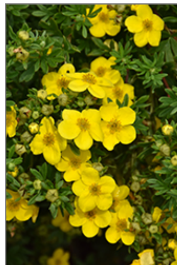
Happy Face Yellow Potentilla flowers