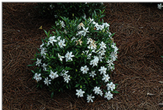
Frost Proof Hardy Gardenia in bloom