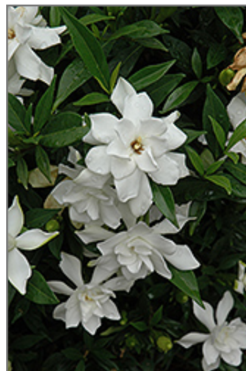
Frost Proof Hardy Gardenia flowers

This is a dense multi-stemmed evergreen houseplant with an upright spreading habit of growth. This plant may benefit from an occasional pruning to look its best.