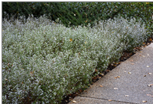
Dwarf Calamint in bloom

Dwarf Calamint is recommended for the following landscape applications;