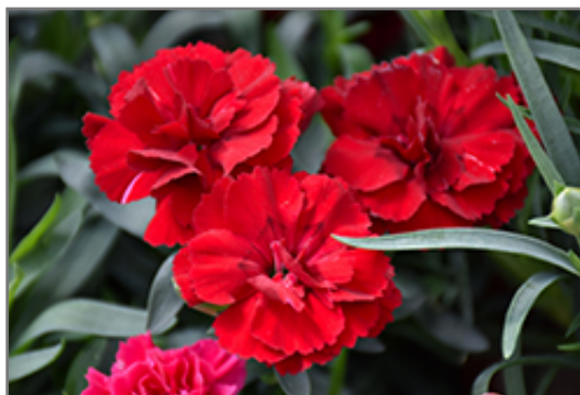
Oscar Dark Red Carnation flowers

Fully double dark red miniature carnations on short stems and compact plants; blooms consistently over a long season, especially in warmer climates; great for border fronts, containers, and floral arrangements