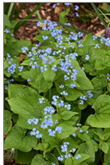
Siberian Bugloss flowers