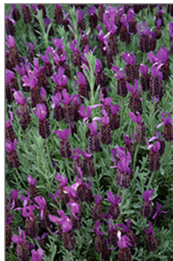
Anouk Supreme Spanish Lavender flowers

Anouk Supreme Spanish Lavender is recommended for the following landscape applications;