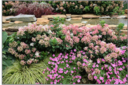
Little Quick Fire Hydrangea in bloom

Little Quick Fire Hydrangea makes a fine choice for the outdoor landscape, but it is also well-suited for use in outdoor pots and containers. With its upright habit of growth, it is best suited for use as a 'thriller' in the 'spiller-thriller-filler' container combination; plant it near the center of the pot, surrounded by smaller plants and those that spill over the edges. It is even sizeable enough that it can be grown alone in a suitable container. Note that when grown in a container, it may not perform exactly as indicated on the tag - this is to be expected. Also note that when growing plants in outdoor containers and baskets, they may require more frequent waterings than they would in the yard or garden.