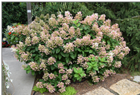
Little Quick Fire Hydrangea in bloom