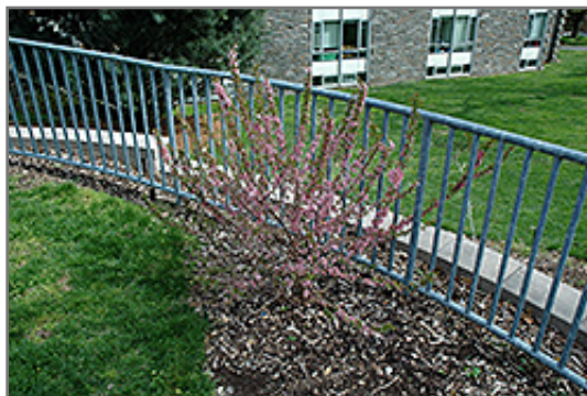
Dwarf Bush Cherry in bloom