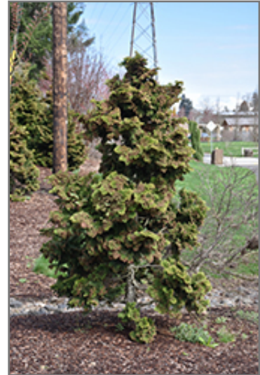
Koster's Falsecypress

Koster's Falsecypress makes a fine choice for the outdoor landscape, but it is also well-suited for use in outdoor pots and containers. Because of its height, it is often used as a 'thriller' in the 'spiller-thriller-filler' container combination; plant it near the center of the pot, surrounded by smaller plants and those that spill over the edges. It is even sizeable enough that it can be grown alone in a suitable container. Note that when grown in a container, it may not perform exactly as indicated on the tag - this is to be expected. Also note that when growing plants in outdoor containers and baskets, they may require more frequent waterings than they would in the yard or garden.