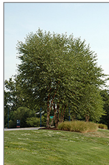
Heritage River Birch (clump)