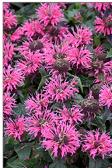
Bubblegum Blast Beebalm flowers