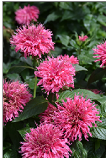
Bubblegum Blast Beebalm flowers