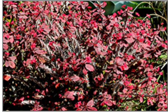
Crown Of Thorns in fall

Crown Of Thorns will grow to be about 6 feet tall at maturity, with a spread of 3 feet. It has a low canopy with a typical clearance of 1 foot from the ground. Although it's not a true annual, this slow-growing plant can be expected to behave as an annual in our climate if left outdoors over the winter, usually needing replacement the following year. As such, gardeners should take into consideration that it will perform differently than it would in its native habitat.