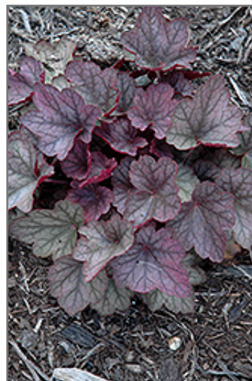
Carnival Rose Granita Coral Bells foliage

Carnival Rose Granita Coral Bells is recommended for the following landscape applications;