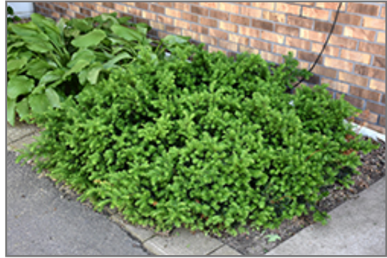
Emerald Spreader Yew

This shrub performs well in both full sun and full shade. However, you may want to keep it away from hot, dry locations that receive direct afternoon sun or which get reflected sunlight, such as against the south side of a white wall. It does best in average to evenly moist conditions, but will not tolerate standing water. It is not particular as to soil type or pH. It is highly tolerant of urban pollution and will even thrive in inner city environments, and will benefit from being planted in a relatively sheltered location. Consider applying a thick mulch around the root zone in winter to protect it in exposed locations or colder microclimates. This is a selected variety of a species not originally from North America, and parts of it are known to be toxic to humans and animals, so care should be exercised in planting it around children and pets.