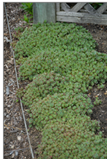
Lime Zinger Stonecrop

Lime Zinger Stonecrop will grow to be only 4 inches tall at maturity extending to 6 inches tall with the flowers, with a spread of 18 inches. When grown in masses or used as a bedding plant, individual plants should be spaced approximately 15 inches apart. Its foliage tends to remain low and dense right to the ground. It grows at a fast rate, and under ideal conditions can be expected to live for approximately 15 years. As an herbaceous perennial, this plant will usually die back to the crown each winter, and will regrow from the base each spring. Be careful not to disturb the crown in late winter when it may not be readily seen!