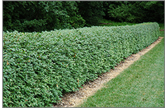
Winged Burning Bush

This shrub performs well in both full sun and full shade. It is very adaptable to both dry and moist locations, and should do just fine under average home landscape conditions. It is not particular as to soil type or pH. It is highly tolerant of urban pollution and will even thrive in inner city environments. This species is not originally from North America.