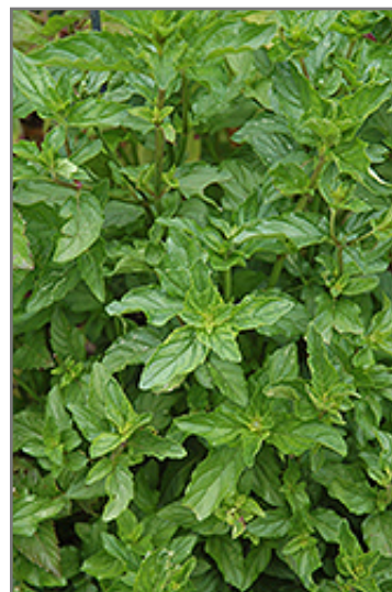
Margarita Mint foliage

Aside from its primary use as an edible, Margarita Mint is suitable for the following landscape applications;