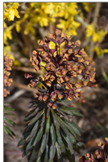
Purple Wood Spurge flower buds