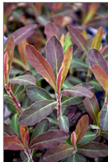
Purple Wood Spurge foliage

Purple Wood Spurge is a fine choice for the garden, but it is also a good selection for planting in outdoor pots and containers. It is often used as a 'filler' in the 'spiller-thriller-filler' container combination, providing a mass of flowers and foliage against which the thriller plants stand out. Note that when growing plants in outdoor containers and baskets, they may require more frequent waterings than they would in the yard or garden.