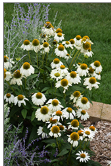
PowWow White Coneflower in bloom