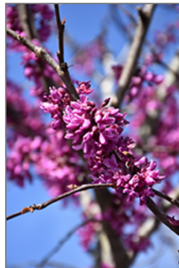
Eastern Redbud (tree form) flowers