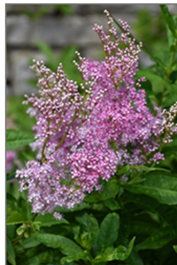
Venusta Queen Of The Prairie flowers