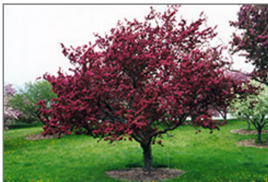
Profusion Flowering Crab in bloom