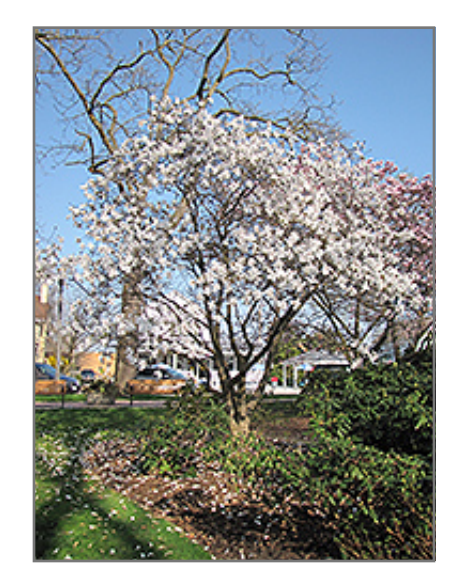
Waterlily Magnolia in bloom