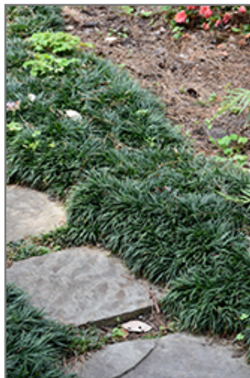
Dwarf Mondo Grass