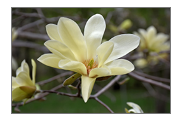
Gold Star Magnolia flowers

This is a relatively low maintenance tree, and should only be pruned after flowering to avoid removing any of the current season's flowers. It has no significant negative characteristics.