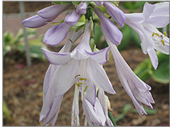
Fried Bananas Hosta flowers

Fried Bananas Hosta will grow to be about 24 inches tall at maturity extending to 3 feet tall with the flowers, with a spread of 4 feet. When grown in masses or used as a bedding plant, individual plants should be spaced approximately 4 feet apart. Its foliage tends to remain dense right to the ground, not requiring facer plants in front. It grows at a fast rate, and under ideal conditions can be expected to live for approximately 10 years. As an herbaceous perennial, this plant will usually die back to the crown each winter, and will regrow from the base each spring. Be careful not to disturb the crown in late winter when it may not be readily seen!