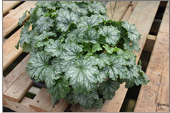
Paris Coral Bells foliage

Paris Coral Bells will grow to be about 8 inches tall at maturity extending to 14 inches tall with the flowers, with a spread of 14 inches. When grown in masses or used as a bedding plant, individual plants should be spaced approximately 12 inches apart. Its foliage tends to remain low and dense right to the ground. It grows at a medium rate, and under ideal conditions can be expected to live for approximately 10 years. As an evergreen perennial, this plant will typically keep its form and foliage year-round.