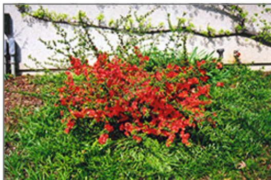
Common Flowering Quince in bloom

This is a high maintenance shrub that will require regular care and upkeep, and should only be pruned after flowering to avoid removing any of the current season's flowers. Gardeners should be aware of the following characteristic(s) that may warrant special consideration;