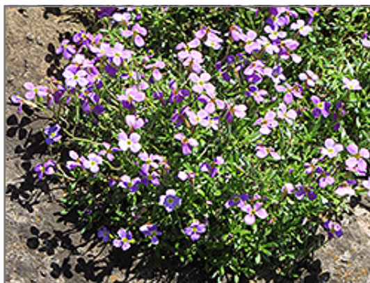
Dwarf Rock Cress in bloom