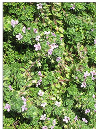
Pink Chintz Creeping Thyme flowers