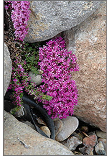
Pink Chintz Creeping Thyme in bloom

This plant should only be grown in full sunlight. It prefers to grow in average to dry locations, and dislikes excessive moisture. It is considered to be drought-tolerant, and thus makes an ideal choice for a low-water garden or xeriscape application. It is not particular as to soil type or pH. It is highly tolerant of urban pollution and will even thrive in inner city environments. Consider covering it with a thick layer of mulch in winter to protect it in exposed locations or colder microclimates. This is a selected variety of a species not originally from North America. It can be propagated by division; however, as a cultivated variety, be aware that it may be subject to certain restrictions or prohibitions on propagation.