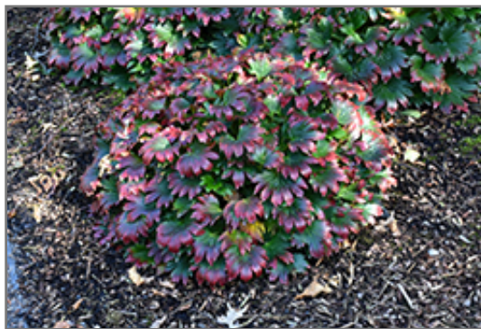
Crimson Fans Mukdenia