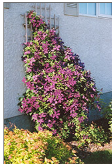
Polish Spirit Clematis in bloom