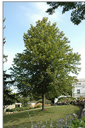
Celebration Maple