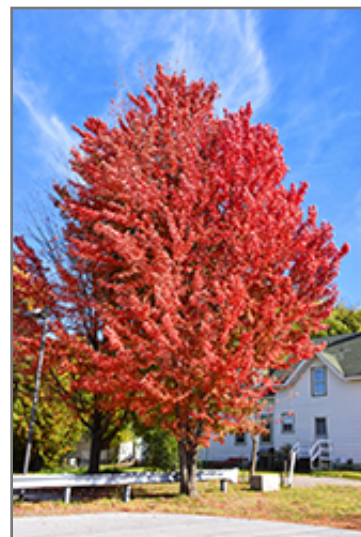
Celebration Maple in fall