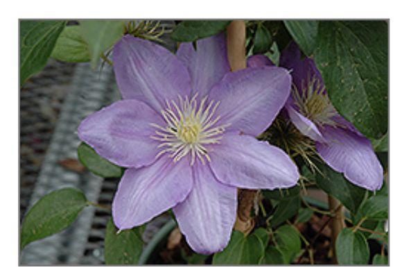
Cezanne Clematis flowers