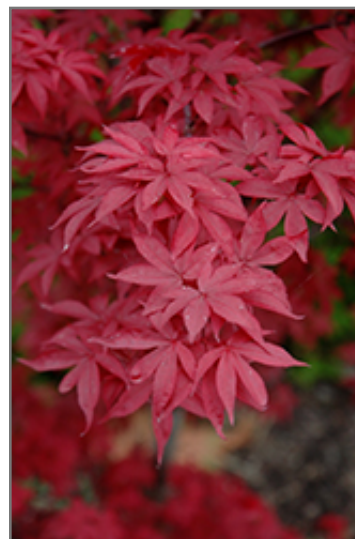
Twombly's Red Sentinel Japanese Maple foliage